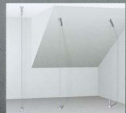
Application on slanting walls